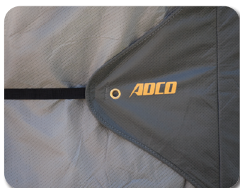
Front and Rear Cinching System Removes slack & reduces billowing