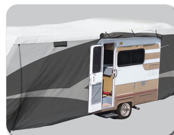
Passenger-Side Zipper Entry Doors for easy covered access, regardless of door position (Excludes Camper Trailer)