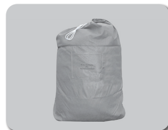
Storage Bag Included Easily store your cover when it is not in use