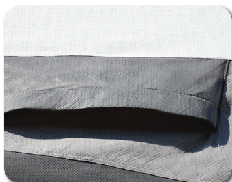
Air Vents Help the cover to breathe and prevent mould and mildew (Excludes Camper Trailer)