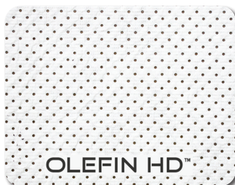
Olefin HD™ Roof Panel Effectively blocks 99.8% of the sun's damaging UV rays & beads water on contact