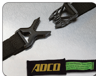
Weighted Buckle Toss-Under Allows you to easily toss the installation straps under your RV to connect to the opposite side